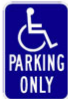
Figure 4 ("R99")