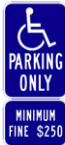
Figure 5 ("R99B")