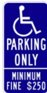
Figure 6 ("R99C")